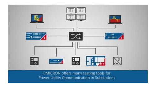
OMICRON offers a wide range of testing tools for Power Utility Communication in substations