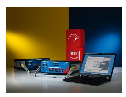
DANEO 400: Measurement, recording and analysis of all signals in PAC systems