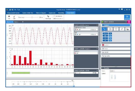
Powerful analysis with DANEO Control 4.00