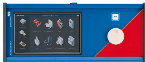
CMC 353 with CMControl-3 Front Panel Control (option)

Besides its operation with the powerful Test Universe software running on a PC, the CMC 353 can also manually be controlled with the highly flexible CMControl unit and the CMControl App running on an Android Tablet or a Windows PC. For more information please visit our website.