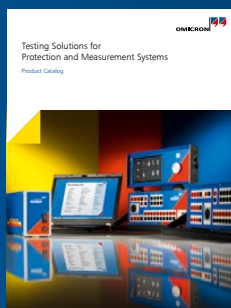
Product catalog (secondary equipment)

The following publications provide detailed information on the products described in this brochure and their applications: