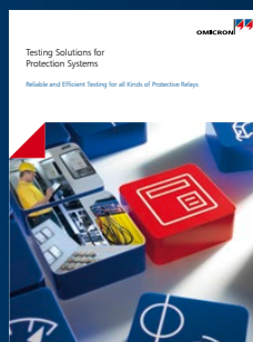
Testing Solutions for Protection Systems

For more information, additional literature, and detailed contact information of our worldwide offices please visit our website.