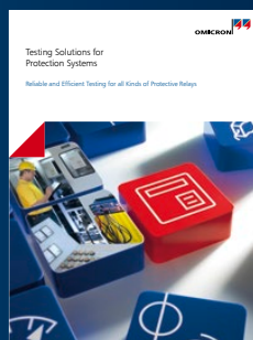
Testing Solutions for Protection Systems