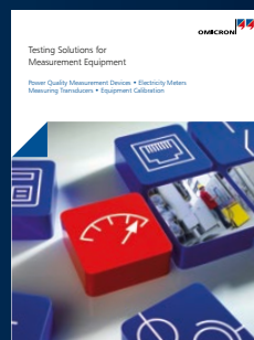
Testing Solutions for Measurement Equipment

For more information, additional literature, and detailed contact information of our worldwide offices please visit our website.