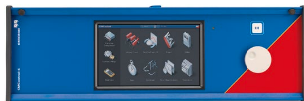
CMControl Front Panel Control (option)

Besides its operation with the powerful Test Universe software running on a PC, the CMC 256plus can also manually be controlled with the highly flexible CMControl unit and the CMControl App running on an Android Tablet or a Windows PC. For more information please visit our website.