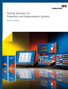
Product catalog (secondary equipment)

The following publications provide detailed information on the products described in this brochure and their applications: