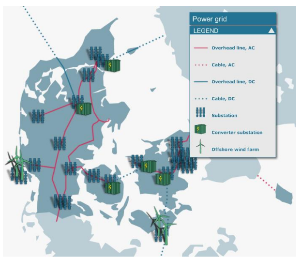
Bild 1: The Danish 400-kV system with international con nections and offshore wind farms

As part of its cabling program, the Danish government has also given its approval to a number of improvement projects that involve replacing overhead lines with high-voltage cables.