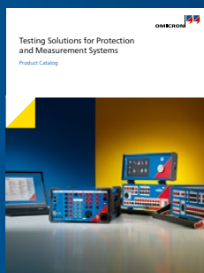
Product catalog (secondary equipment)

The following publications provide detailed information on the products described in this brochure and their applications: