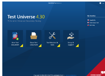
New startpage of Test Universe 4.30